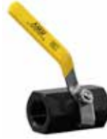
MEDIUM PRESSURE BALL VALVES