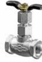
HIGH PRESSURE NEEDLE VALVES