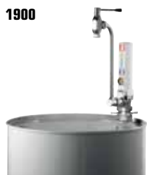
Pump not included